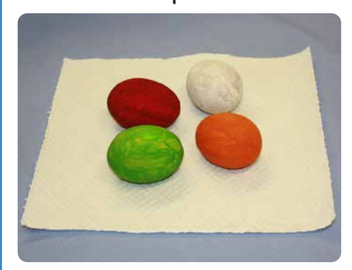
Colour them in food dye or acrylic paint. Leave to dry.