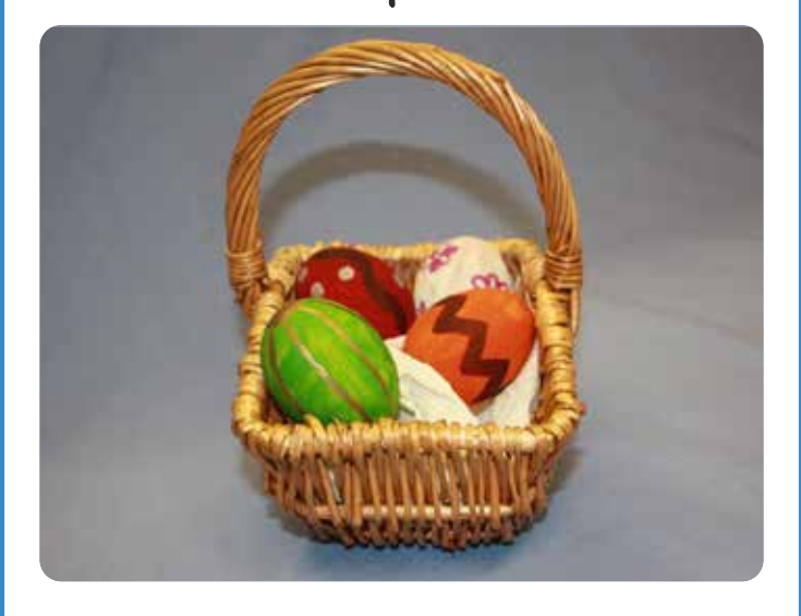
You can even add sequins onto your egg. Repeat and make more decorated eggs!