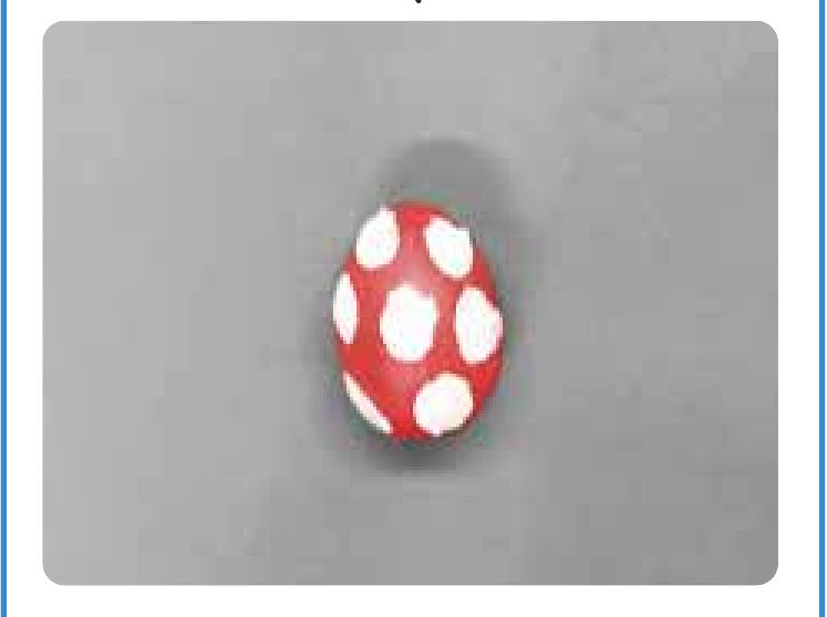
Paint on your design with acrylic paint. Leave to dry.